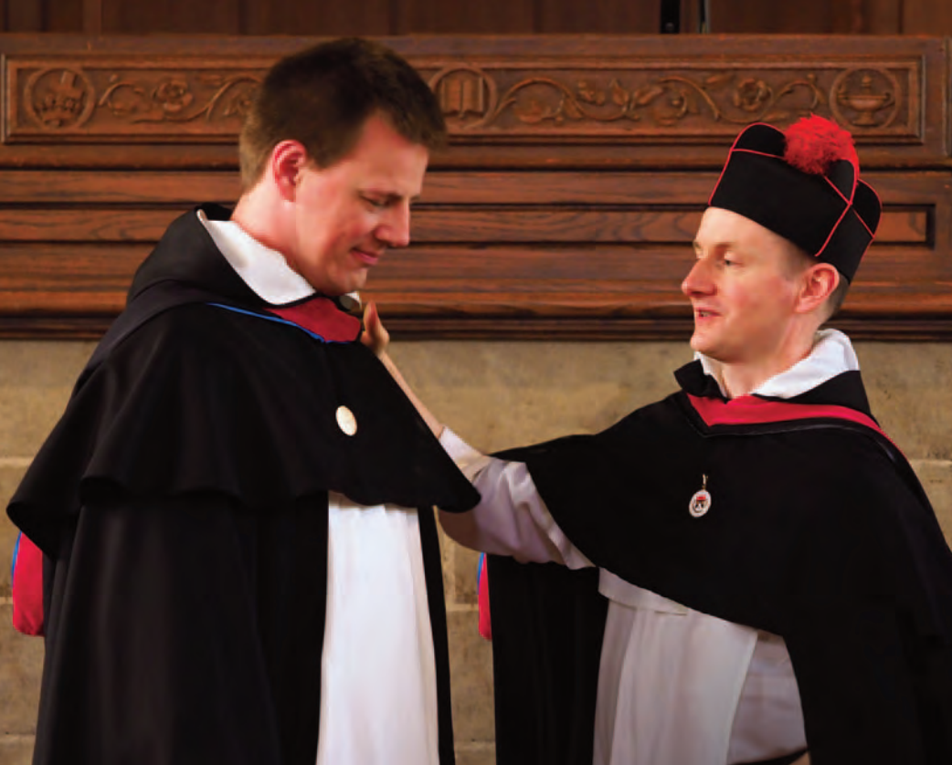
(L) A Dominican School graduate is hooded by his academic advisor. (below) Dominican School builds on a rich history of helping to form friars since 1932.