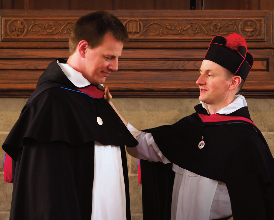
(L) A DSPT graduate is hooded by his academic advisor. (below) DSPT builds on a rich history of helping to form friars since 1932.